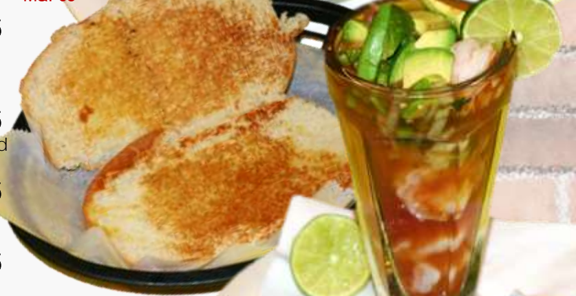
Cocktel de Camaron