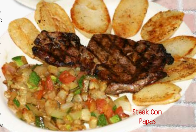
Steak Con Papas