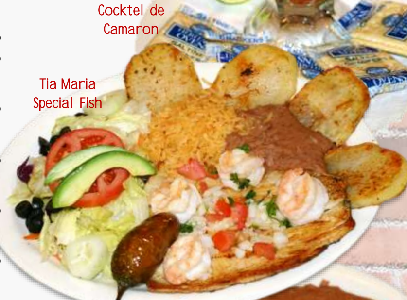
Tia Maria Special Fish