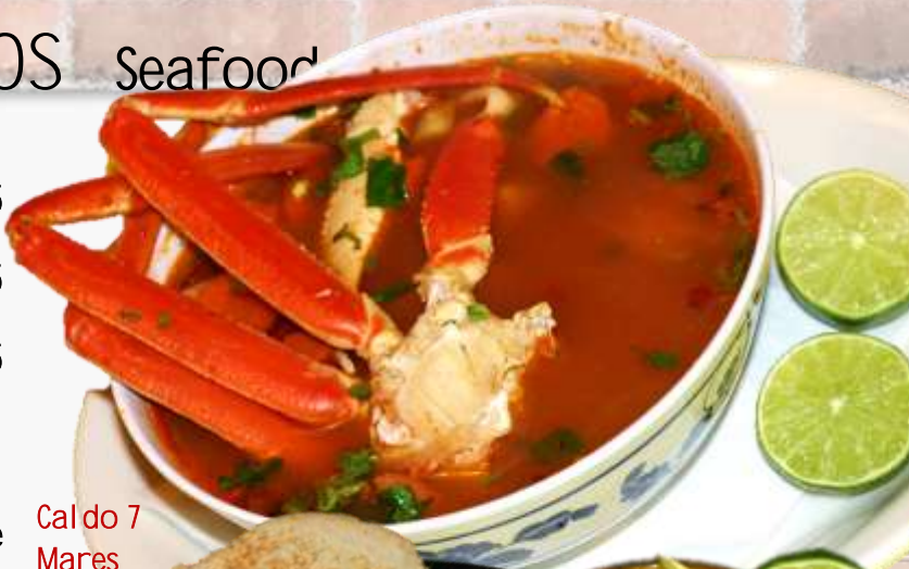
Caldo 7 Mares