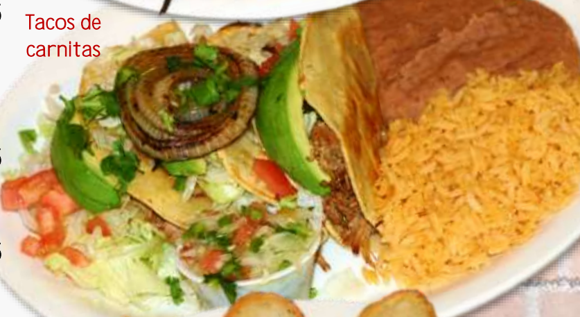
Tacos de carnitas